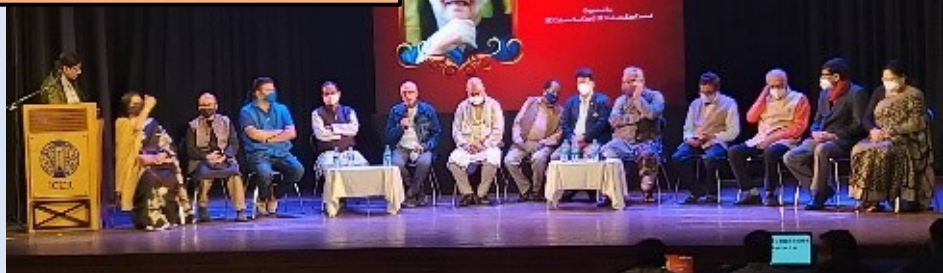
Legendary actor Rtn. Soumitra Chatterjee was member of RC of Calcutta Sun City. The club paid homage to the departed soul at ICCR Hall on 13.12.2020, 5PM through an intimate condolence meeting where renowned authors, poets and artists from various fields shared their candid memories of the versatile artist.

Rotary Website and App – Masterclass: Every Wednesday 4.30 – 5.30pm A very useful Online Training program for Rotarians , particularly helpful in this new digital age.