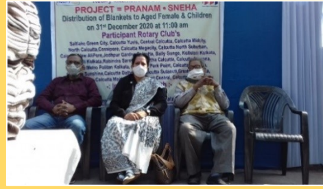
Distribution of Blankets as a co-host club, with host club Kadamtala Milan Sangha.