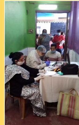
Eye camp as a co-host club, with host club Kadamtala Milan Sangha.